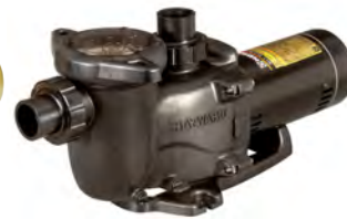
MAXFLO XL SINGLE-SPEED