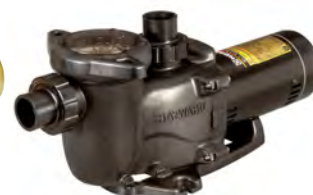
MAXFLO XL SINGLE-SPEED