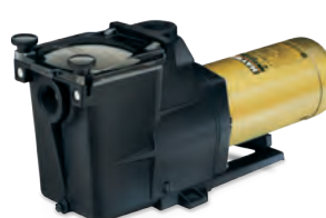
SUPER PUMP SINGLE-SPEED